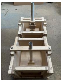
Moulds for plinths