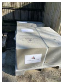
Blocks packed to go