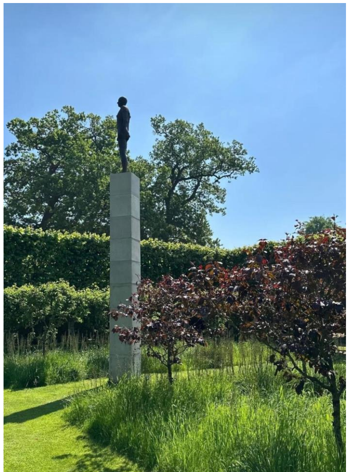
'Time Horizon' by Sir Anthony Gormley